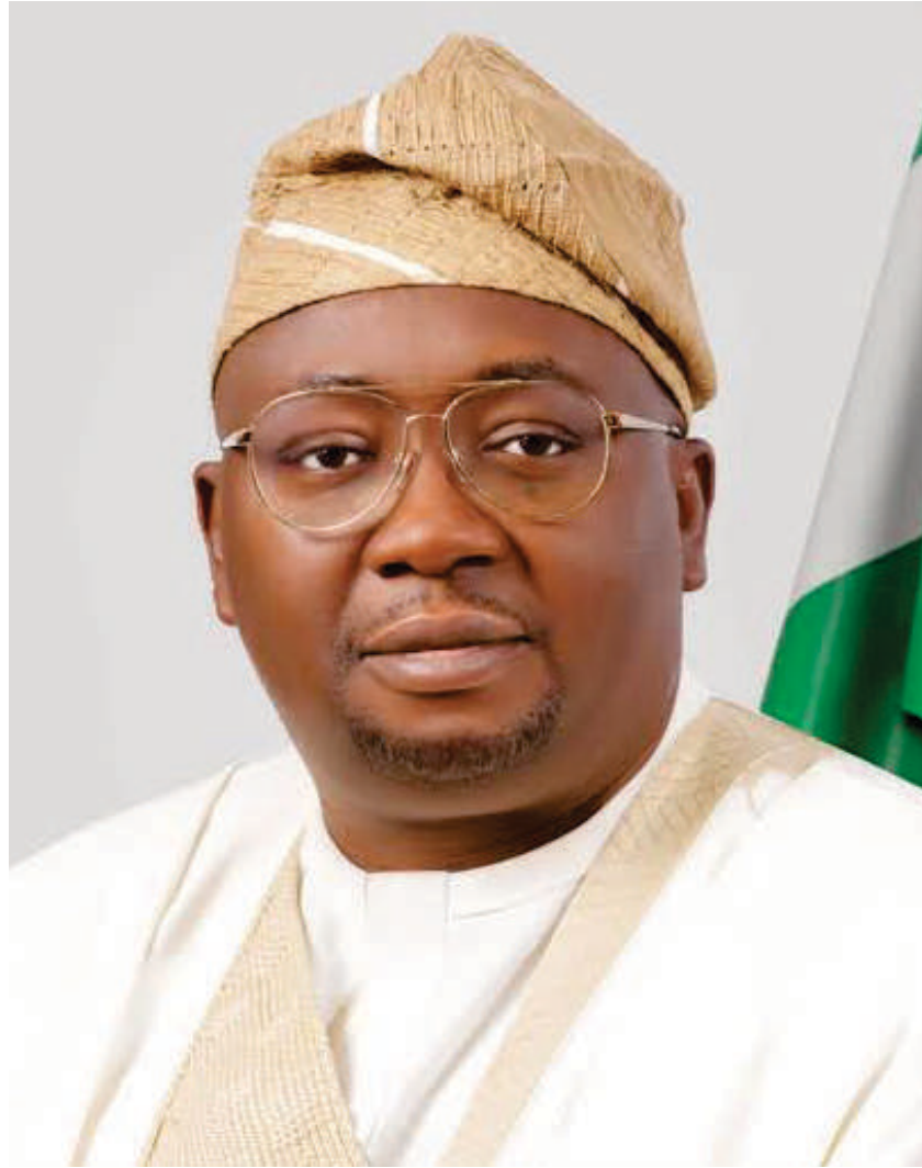
CHIEF ADEBAYO A. ADELABU , OFR, FCA, FCIB HONOURABLE MINISTER FEDERAL MINISTRY OF POWER