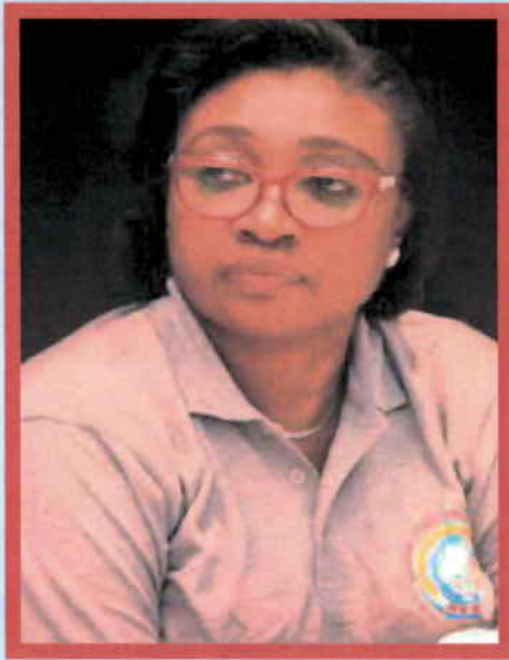
Vivacious Lady V